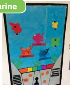
Dewdrops Early Learning, Reservoir, Vic