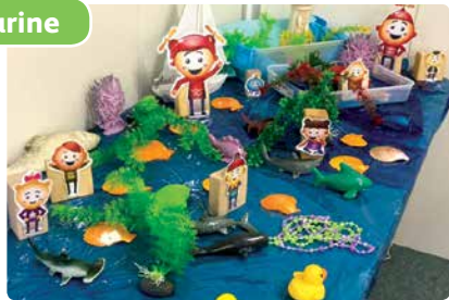
Leeton Early Learning Centre, Leeton, NSW