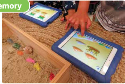
Kids and Co Preschool, Hurstville Grove, NSW