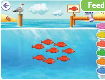
Feed the fish