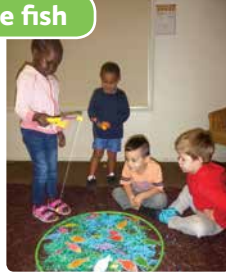
Waratah Cottage Early Learning Centre, Claymore, NSW