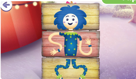
Flip a part