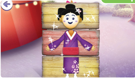
Flip a part

Bring the app environment into your play space