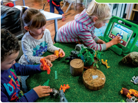
Animal feeding time

Bring the app environment into your play space