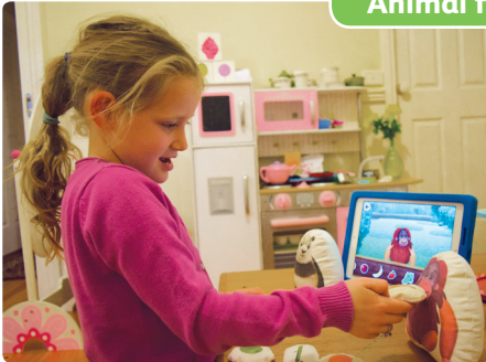
Animal feeding time