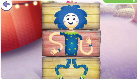
Flip a part