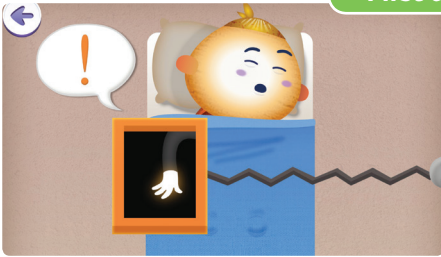
First aid helper